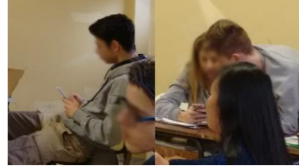
Figure 3. Users testing the serious game during phase 4.

The backbone of this idea has been already introduced to teenagers during the first pre-pilot in the Italy (n=10), Spain (n=18) and England (n=16) as mock-ups. The activities